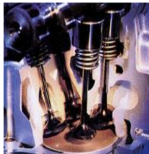
noise sunction material